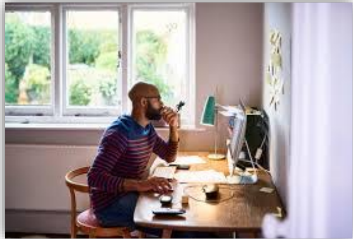
WORK FROM HOME