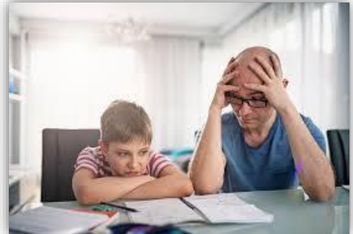
MATH HOME SCHOOL QUALIFIED